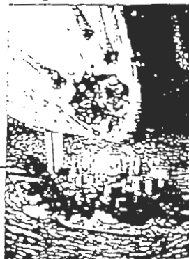
This won't happen

But if it's spinning very slowly, it is likely a new class of asteroid. Most of these rocky chunks, left from the formation of the solar system, circle between Mars and Jupiter or travel in a very elongated orbit. The object has a circular orbit.